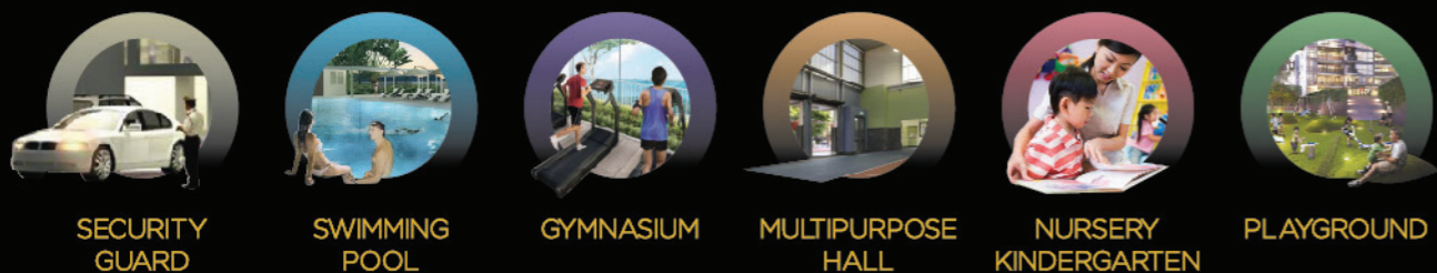
SECURITY GUARD SWIMMING POOL GYMNASIUM MULTIPURPOSE HALL NURSERY KINDERGARTEN PLAYGROUND

Residensi Pandanmas offers various amenities to ensure your family feel safe and comfortable. Such as: