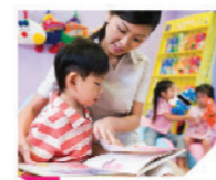
Nursery & Kindergarten